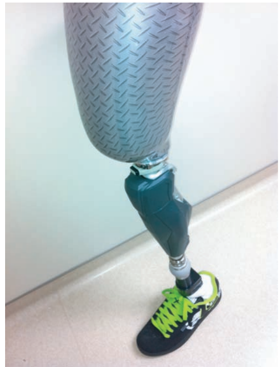
FIGURE 2 The X2 microprocessor knee (Otto Bock, Minneapolis, MN) has five on-board sensors that help to more intuitively balance the requirements of stability and mobility under various ambulation conditions.

Osseointegration is an emerging surgical technique for direct skeletal attachment of prostheses which may one day render sockets antiquated and obsolete for many patients. Although the attempted permanent coupling of metallic implants to the skeleton has been in use for decades in the maxillofacial and dental fields, this field has expanded to residual limbs in only the last two decades (40). Typically, a titanium or other alloy device is first inserted into the terminal bone of the residual limb, and then delivered through the skin via attachment of the prosthesis coupling during a second, staged procedure. This results in improved anchorage and responsiveness of prostheses, as well as greater proprioceptive feedback