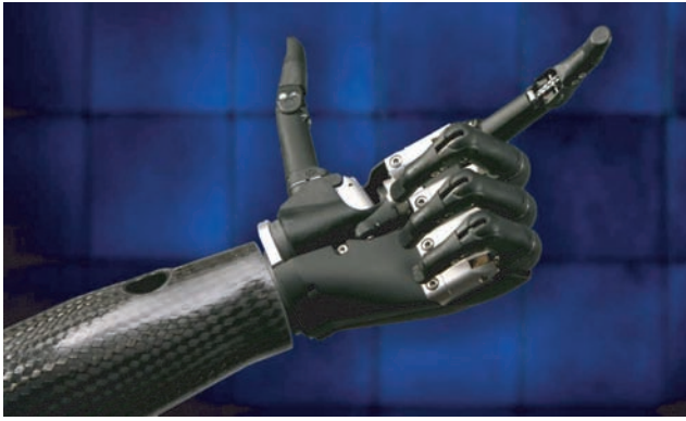
FIGURE 4 Recently, a number of prosthetic hands have been introduced to market, including the iLimb pulse (Touch Bionics, Hiliard, OH), which allow individual finger movement and variation of grip position.

inputs, allowing simultaneous control of up to several elbow functions. The microprocessor in the elbow acts like a computer server, processing the myoelectric signal and sending it to the desired powered device (elbow, wrist, or hand). TMR-compatible elbows can process the signals from multiple inputs simultaneously. This allows the user simultaneous control of the components of the prosthesis; wrist, hand, and elbow more closely mimicking the movement of the natural human arm.