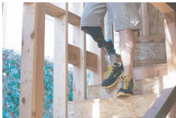
FIGURE 1 The BiOM powered ankle is the first commercially available device to deliver powered plantarflexion. This is thought to improve walking efficiency and lessen compensatory gait deviations.

Traditional prosthetic knees are passive in nature and are designed to balance stability with mobility during the gait cycle. Microprocessors have helped to improve the timing of this balance and even anticipate actions such as the stumble recovery feature of the Otto Bock C-leg (Minneapolis, MN). The Ossur Power knee (Aliso Viejo, CA) is the first commercially available knee to