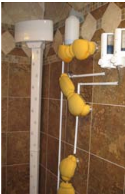
Shower modification with wall-mounted sponges for washing the body, soap dispensers controlled by a foot pedal, and a full-body dryer

Learning to put on and take off the prostheses – donning and doffing – is an important part of prosthetic training. The occupational therapist (OT) works with the patient on learning to don and doff the prostheses without the assistance of another person. No matter the level of limb loss, independence with this task is possible.