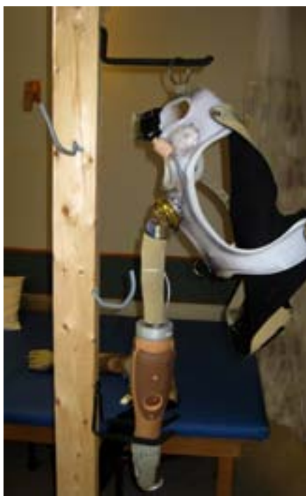
A dressing tree can support clothing or prostheses, enabling bilateral upper-limb amputees to get dressed or don their prostheses independently

Prosthetic training for bilateral upper-limb-loss individuals requires a special approach where each arm is trained independently. The residual limb that is longer or more mobile becomes the dominant arm and hand. Prosthetic training should occur on the dominant side first, with the entire process repeated separately on the non-dominant side. Finally, training continues with the individual wearing both prostheses and attempting bimanual daily tasks.